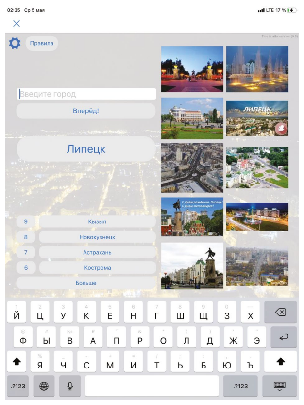
Fig. 2. Gameplay

without the need to modify the program. The program selects the city for the next move randomly from the list of cities for the required letter (for this purpose, a dictionary has been created, where the key is the first letter, and the value is a list of cities for this letter). After randomly selecting a city, the program generates the URL of a Google request to search for images of this city. From the received search result, 10 pictures are randomly selected and displayed on the screen. Figure 2 shows the gameplay.